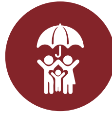
Group Life Insurance